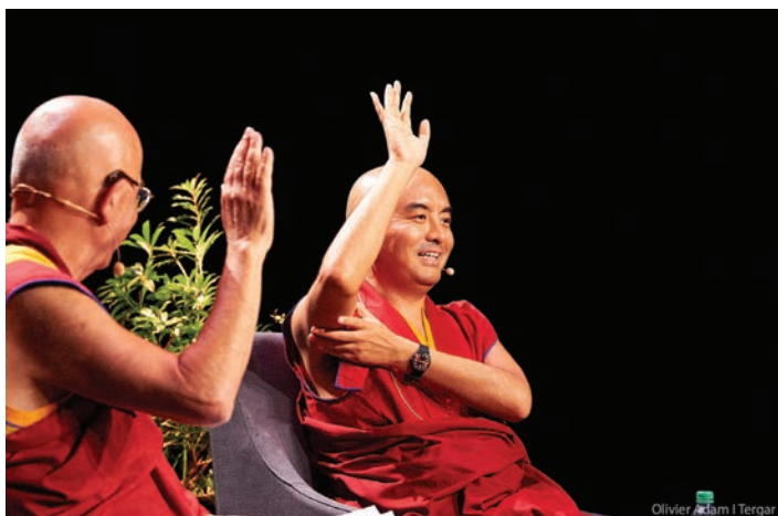
Mingyur Rinpoche leading Matthieu Ricard and a Paris book talk audience in an exercise on awareness of body sensation, September 2019.

“The shorter video content was great - and I appreciated the nice mix of learning experiences and interaction. The pacing and variety were really well-thought-out.”