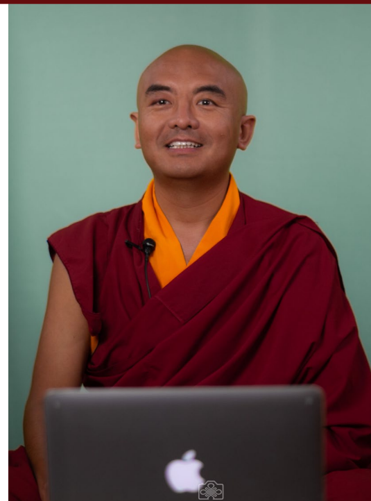
Mingyur Rinpoche in front of the green screen, preparing for streaming teachings during the Path of Liberation online retreat, August 2.

In some ways, connecting to other people is more difficult these days, but modern technology helps us feel connected in new ways. We can meditate with people on the other side of the planet. We can share our experience and form friendships with people we would never meet under normal circumstances. So while we may feel alone and disconnected at times, we are all co-creating this global community. In the months and years to come, I pray that